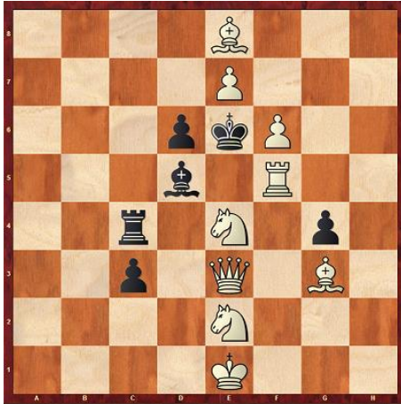
Pal Benko, Chess Life 1975

In December edition we prepared 4 Mate in 2 positions with the Christmas tree theme, suitable for the holiday season. In all 4 positions White to play. Enjoy!