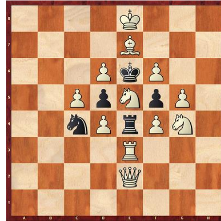
Don French, First Christmas Tree 1996