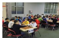
EUROPEAN YOUTH RAPID & BLITZ CHAMPIONSHIP