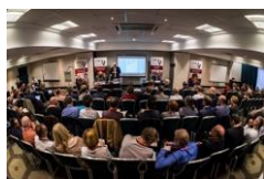
LONDON CHESS CONFERENCE