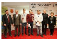
EUROPEAN RAPID & BLITZ CHAMPIONSHIP 2016