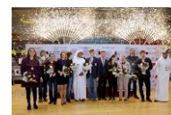
WORLD RAPID & BLITZ CHAMPIONSHIP DOHA 2016